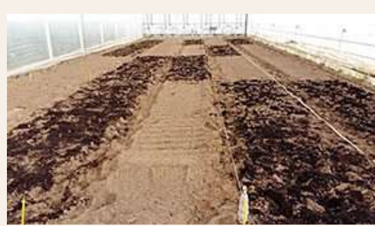
Starting of a tomato trial in Brittany, France.

In April, BRESOV partner Terre d'Essais started a tomato trial on its site in Brittany, France. FiBL started the same trial on-farm in Therwil, Switzerland. The trial is performed as part of BRESOV's work to evaluate the effect of formulations of microorganisms and local compost on crop performance of tomato.