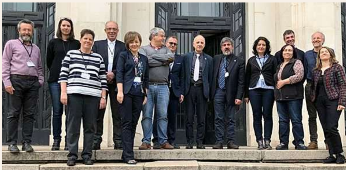
EUGrainLeg Activity meeting.

BRESOV was presented on 10 April 2019 in Bucharest in the frame of the meeting of the EUGrainLeg project funded by European Cooperative Programme for Plant Genetic Resources (ECPGR).