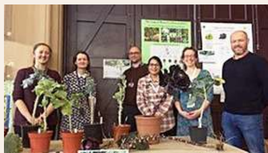
BRESOV crop collection at the Victoria Gallery and Museum.