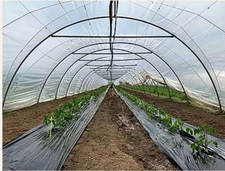
Starting of a tomato trial in Therwil, France.