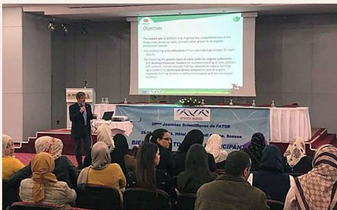
BRESOV presented in Tunisia.