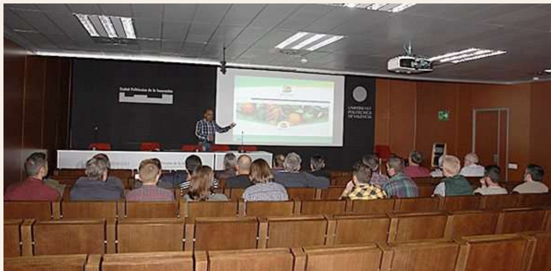
BRESOV meets farmers in Valencia.