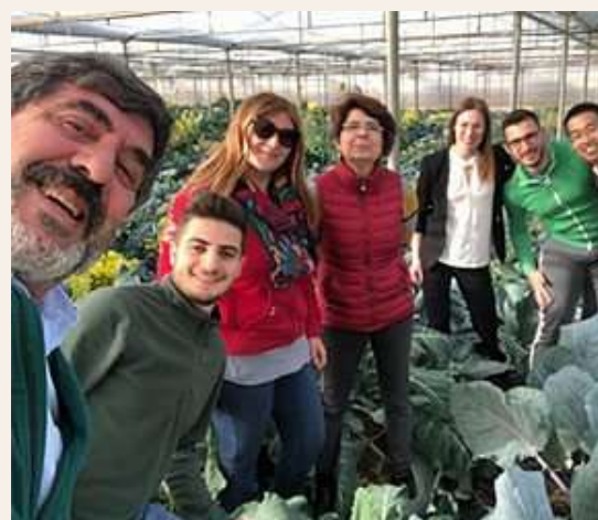
BRESOV project in full swing in Sicily.