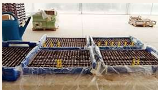
Sowing of tomato in France and Switzerland.