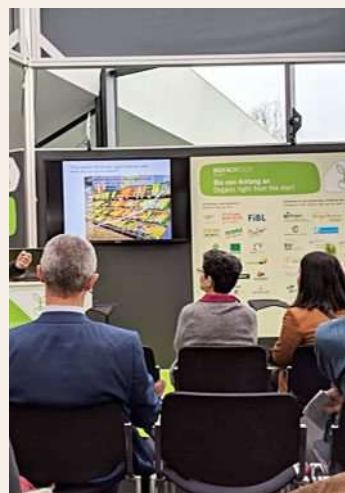
BRESOV at BIOFACH fair.