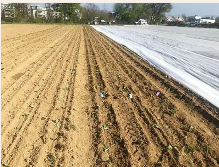
Broccoli variety trial in Switzerland.