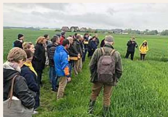
BRESOV at LIVESEED 2nd annual meeting.

The BRESOV coordinator attended the second annual project meeting of the sister project LIVESEED, taking place in Zelechow, Poland, on 14-16 May 2019.